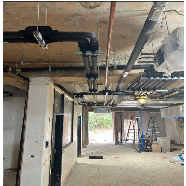
Continue overhead rough-in at the kitchen area