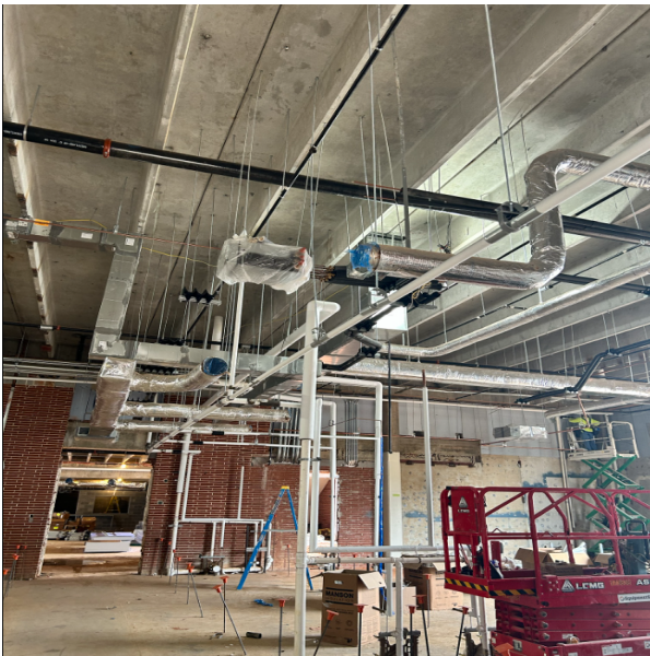
Continue in wall plumbing rough in and overhead rough in at the cafeteria area