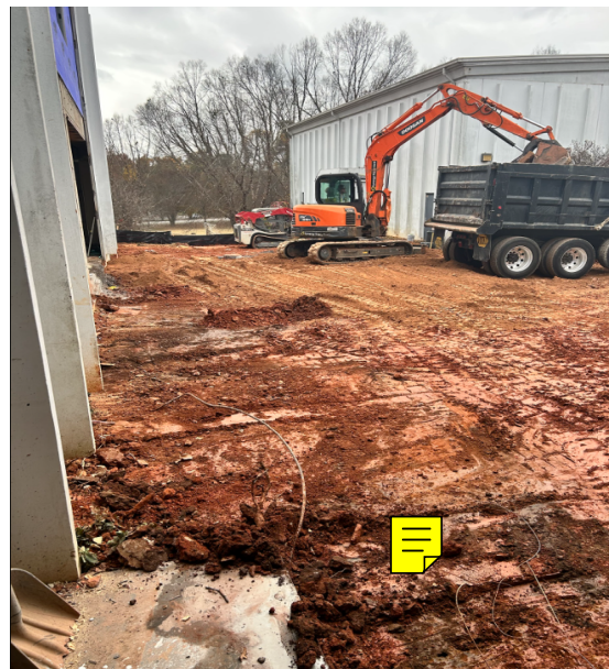
Continue to construct building pad for the new Addition