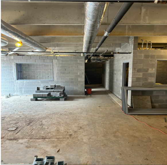
Continue interior CMU wall install in area 3 level 1