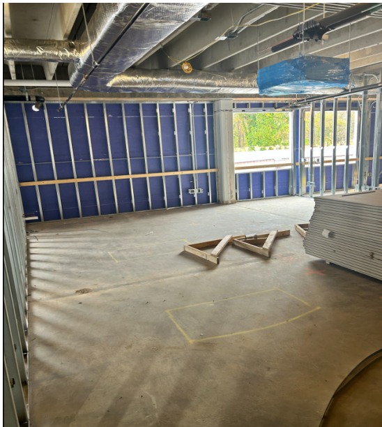
Interior metal stud framing is complete in area 3 level 2